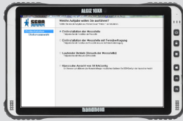
Operating and evaluation software „SEBAConfig“