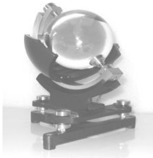
Campbell Stock Type